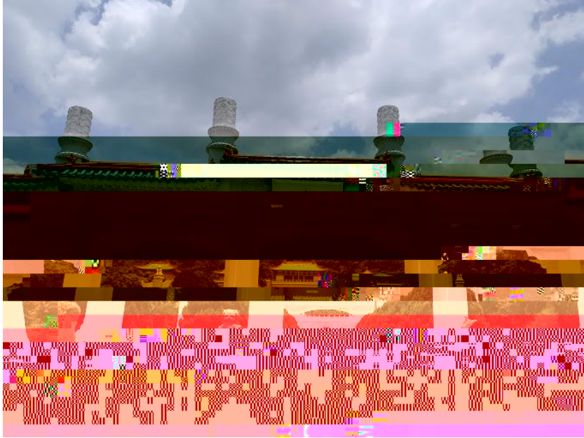
The National Palace Museum in Taipei, Taiwan