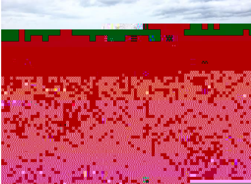
Jin Shui Mountain Roads in Jinguashi, Taiwan